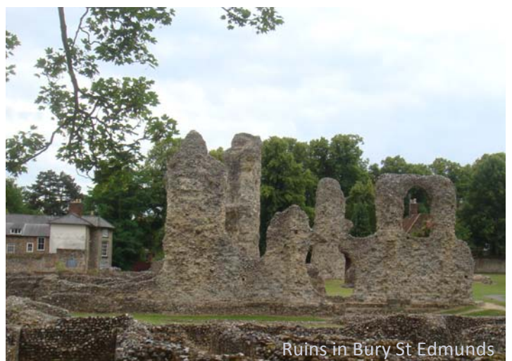
Ruins in Bury St Edmunds

CSSS offers you local guidance from our departmental graduate students. They will show you around Cambridge to familiarise you with the town and also organise fun events for you to join and experience. Each of our summer students will be assigned a graduate student 'mentor', so you can easily seek the help and advice you require to enjoy a smooth stay in Cambridge.